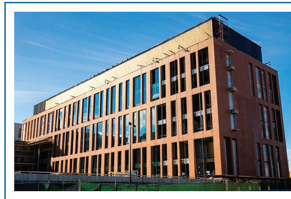
NEW STATE-OF-THE-ART RESEARCH FACILITY